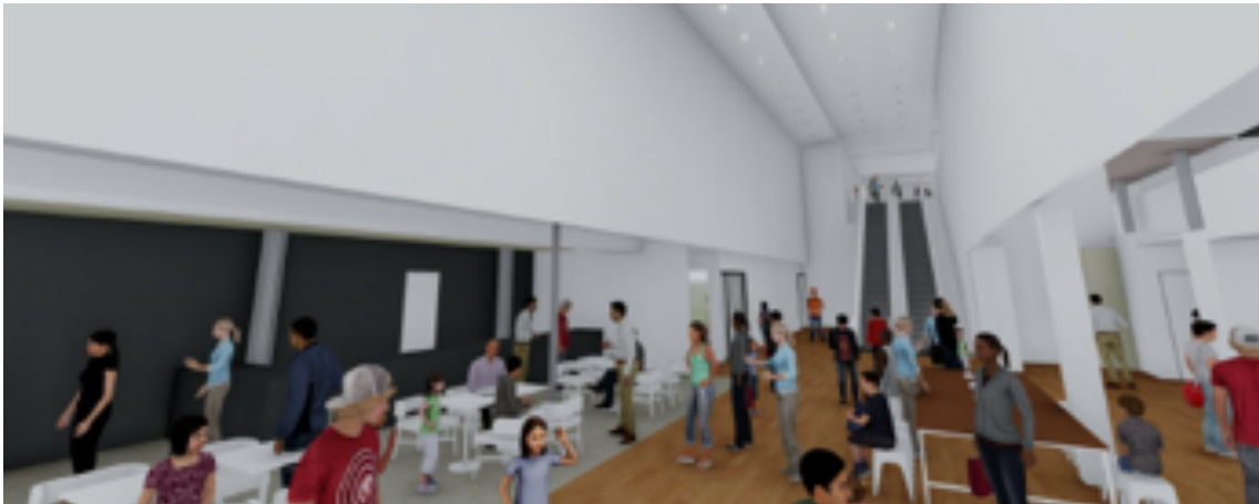
View from the ground floor looking towards the escalators with Food & Beverage operators on left hand side.

The space allocated for this art piece is large rectangular ceiling above the new food court precinct leading up to the escalators in the completed Cairns Airport T2 Domestic Terminal.