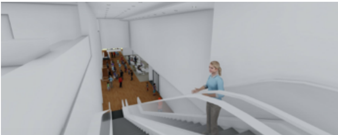
View from top of escalators looking down to the ground level with Food & Beverage operators on right hand side.